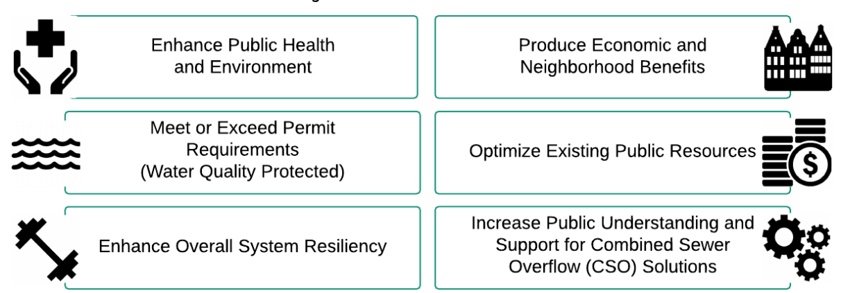
Figure 1: Camden's LTCP Goals

The Camden Stormwater Management and Resource Training ("SMART") Initiative is a community-driven movement to protect human health, improve conditions for economic development, improve water quality, and enhance the quality of life for Camden residents. The partnership includes six community organizations including local and state governments, community non-profits, and academic organizations. Importantly, the initiative focuses on the use of both green and gray infrastructure techniques for stormwater management.